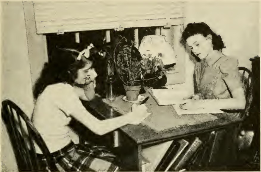
The study hour at Wood Junior College, Mathiston, Mississippi

work. . . . The home economics curriculum has been strengthened through the addition of courses in cooking and nutrition. . . . This year the demonstration work has been reorganized. It is here that the students, who are going out to teach, get their practical experience. Most of them will teach in one-room schools, and so the work here at Sue Bennett has been set upon the one-room basis; all grades housed in the one room. It represents the most difficult type of teaching experience, and if the students learn how to teach in such a situation, they can handle any teaching situation in which they may be placed. The change was recommended by the state director of education.